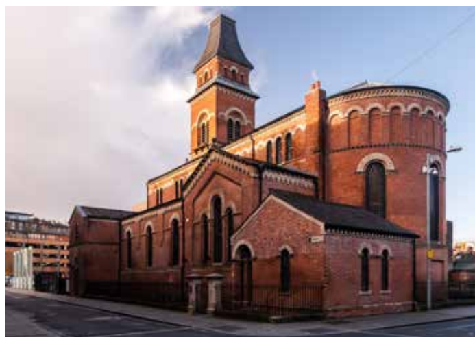
Our 100th AGM will be held at Hallé St Peter's

For more information on any of the events, or to purchase your tickets, please visit our website www.hbap.org.uk .