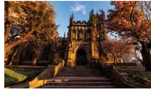
Manchester Cathedral (free entry)