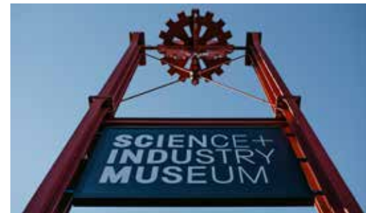
Science and Industry Museum (free entry)