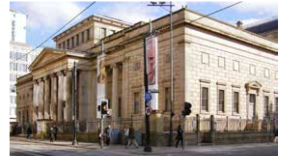
Manchester Art Gallery (free entry)