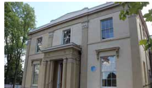
Elizabeth Gaskell's House (£7.50 adults)