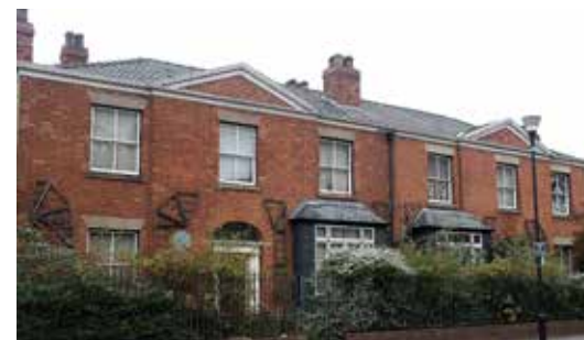
The Pankhurst Centre (free entry, book in advance)