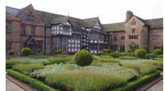
Ordsall Hall (free entry)