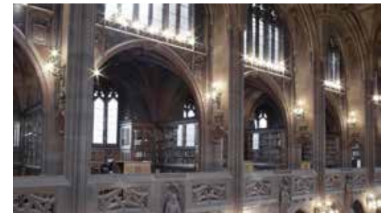
John Rylands Library (free entry)