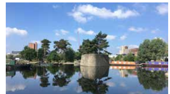
New Islington Marina