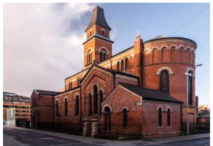
Our 100th AGM will be held at Hallé St Peter's

For more information on any of the events, or to purchase your tickets, please visit our website www.hbap.org.uk .